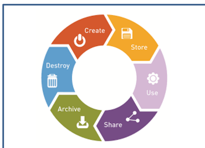
Figure 2: Records Lifecycle

The capture of good records, in the right repositories, reduces the time and resource needed to deliver our strategic priorities and prevents costly duplication of work.