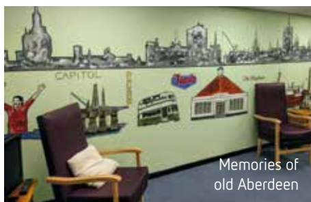
Memories of old Aberdeen