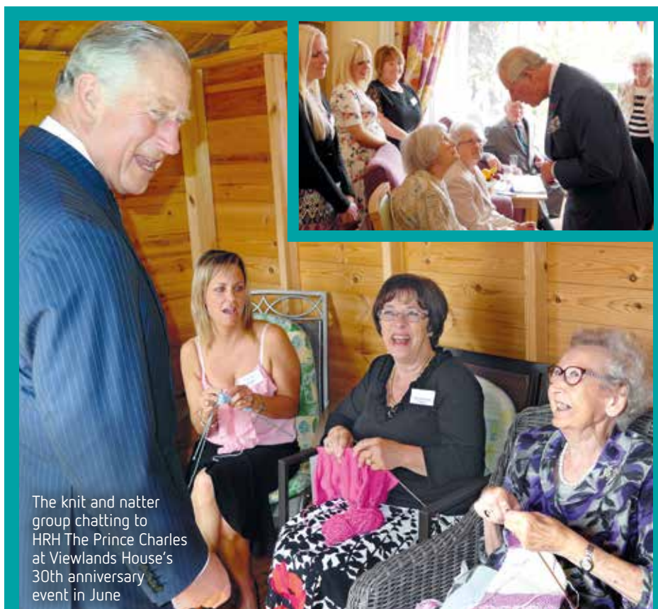
The knit and natter group chatting to HRH The Prince Charles at Viewlands House's 30th anniversary event in June