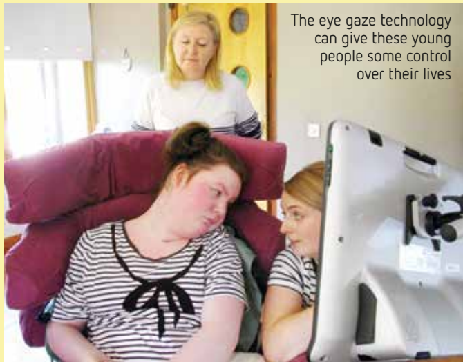
The eye gaze technology can give these young people some control over their lives

"Some people see it as me going above and beyond, but I don't. It is only me doing my job, which I am very passionate about." CN