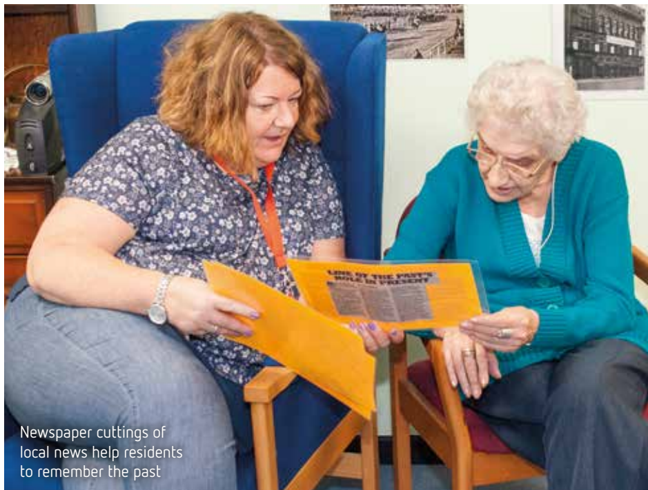
Newspaper cuttings of local news help residents to remember the past