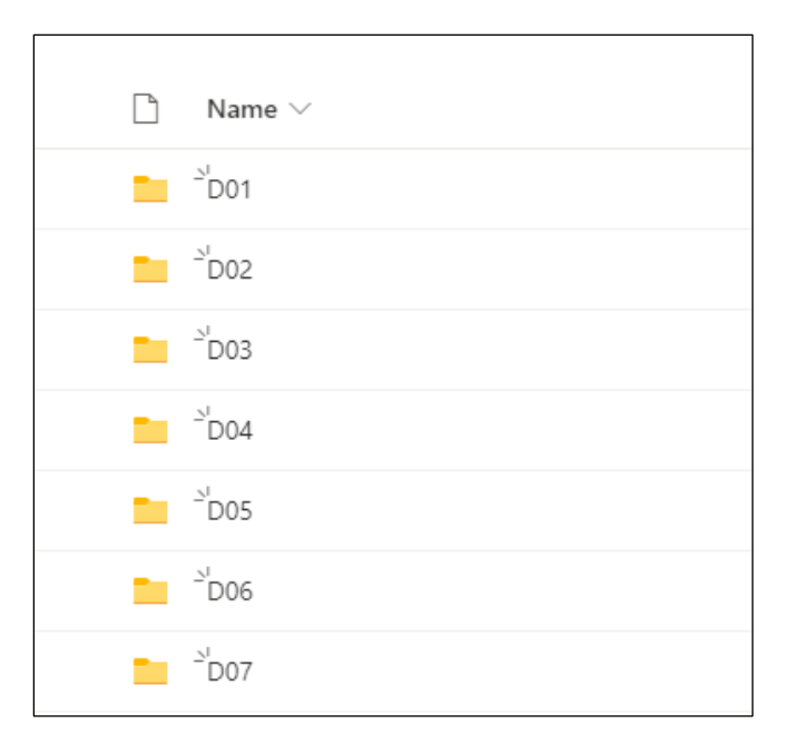
D01 - D40

Clearly marked subfolders delineating the adult protection process are helpful. This provides the joint inspection team with the best opportunity to understand the effectiveness of adult protection practice. i.e.